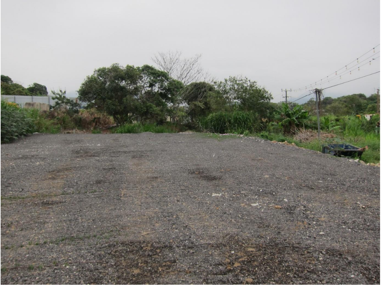
General view at the northeast of the Application Site